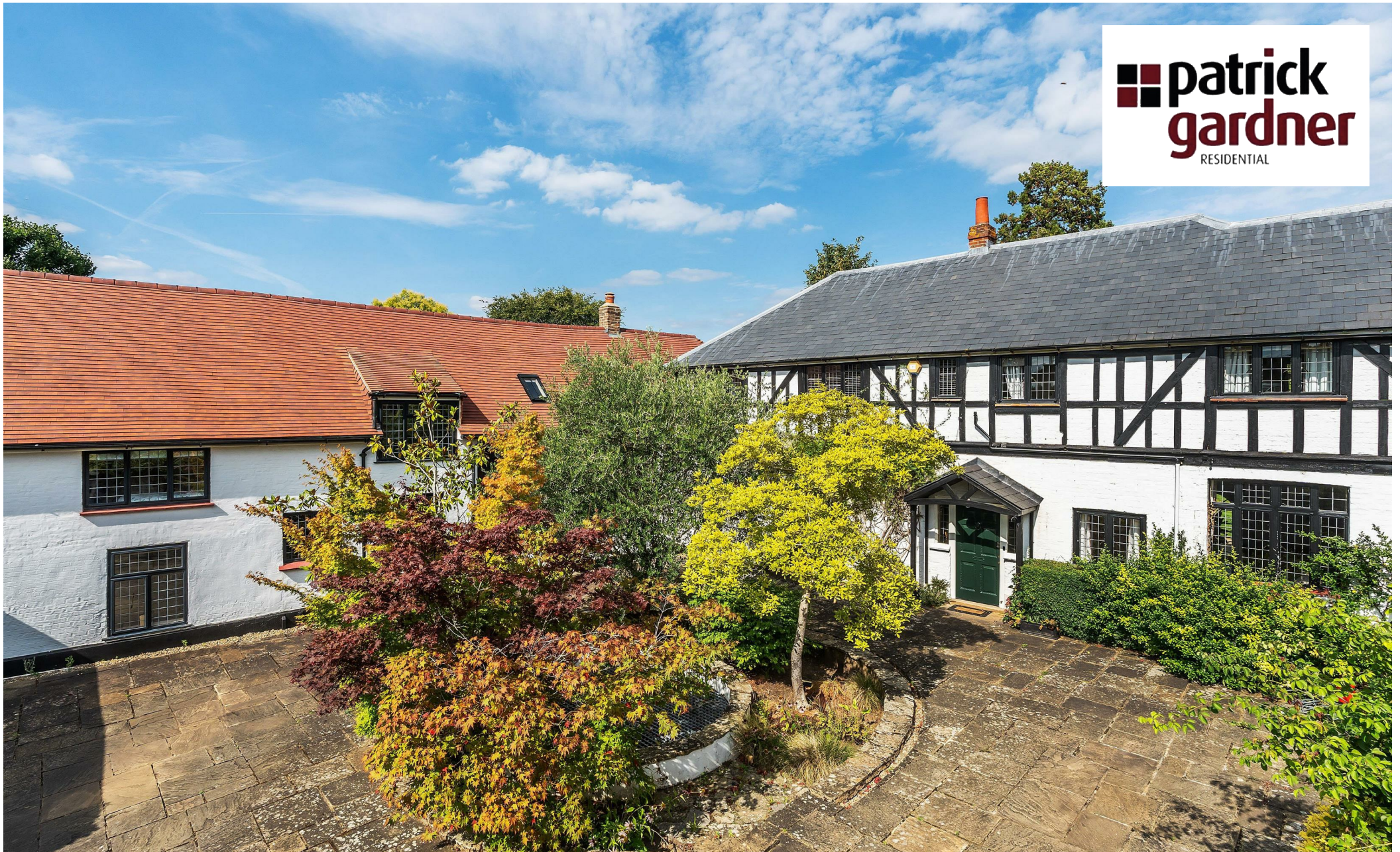
Old Court, 8 The Old Street, Fetcham, Surrey, KT22 9QJ